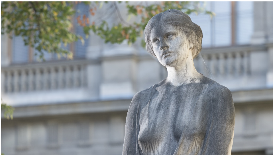
Image 2: The Kastalia statue at the University of Vienna rolls her eyes as well.

Sara Ahmed speaks of rolling eyes that feminists often face in their anti-discriminatory activism as “an expression of collective exasperation because you are a feminist” (Ahmed, 2017, p. 38). (Feminist) Activists are confronted with irritation at their insistence that things are not as they should be and their desire to do something about it. This irritation forces them into a defensive position. Considering that social injustices continue despite decades and centuries of work against them, it is feminists who are irritated, though. Irritated that their enthusiasm is met with derision. Irritated that their knowledge is discarded. Irritated that they have to fight the same fights over and over again. On the occasion of the 20 th anniversary of the Gender Equality and Diversity unit of the University of Vienna, we have decided to reclaim the eyeroll for feminists, for ourselves 3 . It is not only a possibility to vent, but also to find humour in the face of an often demoralizing fight. Finally, by turning the well-known nursery rhyme Row Row Row Your Boat into a protest song, it is an opportunity to find solidarity in a communal activity like singing a canon that allows different voices to come together.